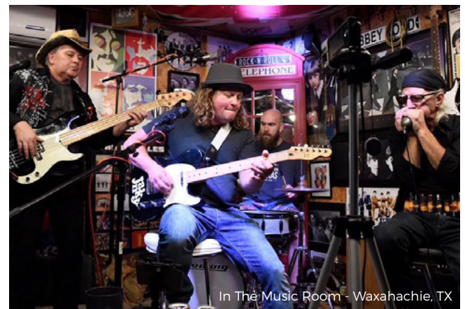
In The Music Room - Waxahachie, TX