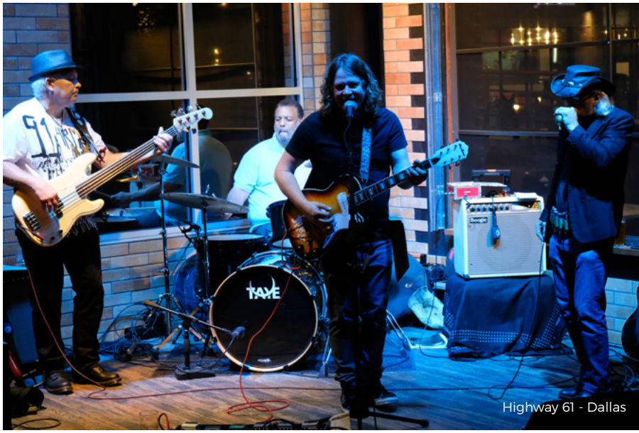
Highway 61 - Dallas