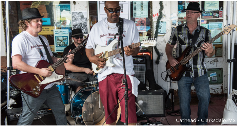
Cathead - Clarksdale, MS