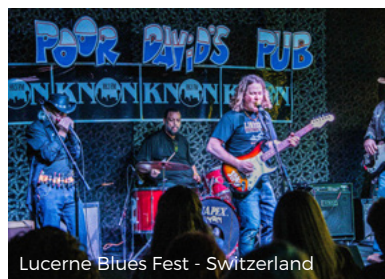
Lucerne Blues Fest - Switzerland