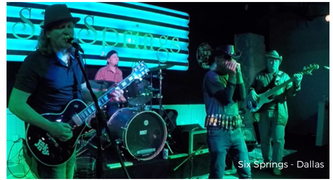
Six Springs - Dallas