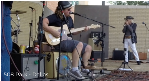
508 Park - Dallas