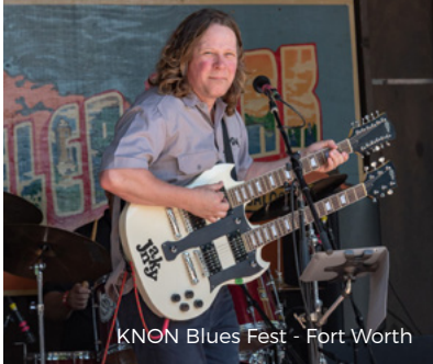
KNON Blues Fest - Fort Worth