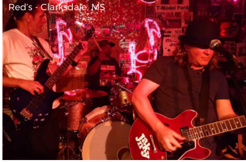
Red's - Clarksdale, MS