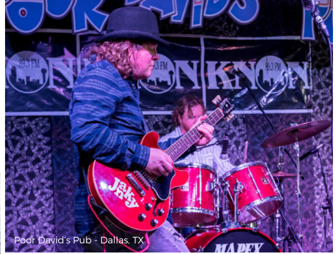
Poor David's Pub - Dallas, TX